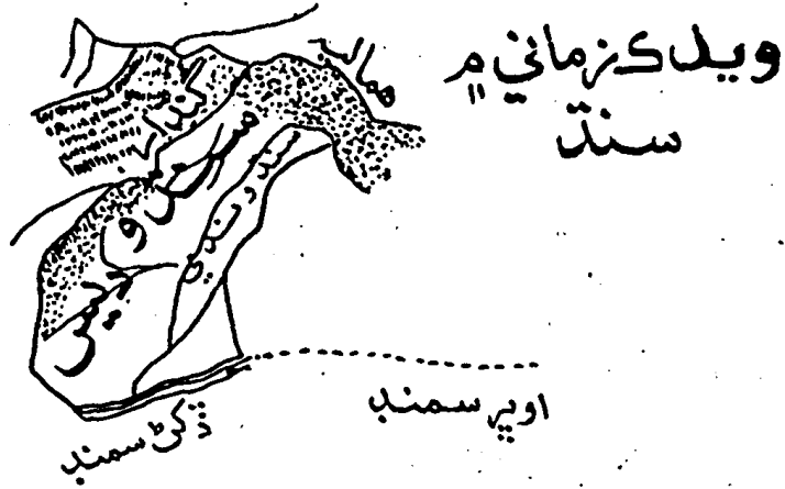
Map of Present Sindh