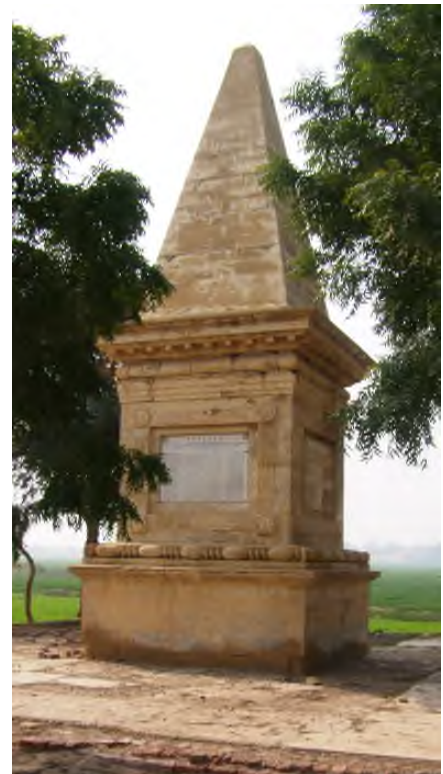
Laurel built by Sir Charles Napier near Miani in the honour of his soldiers who died in the war

Most of the units engaged on the British side at Miani still remain in the Army Lists, and all added to the laurels won on that memorable day. The 22nd is better known as the Cheshire Regiment, while the 25th Bombay Native Infantry beloved by Sir Charles, has become the 5th Battalion (Napier's) 6th Rajputana Rifles. These two Regiments, which fought side by side in Sindh, have ever afterwards exchanged annual congratulatory messages on Miani day. The 12th Bombay Native Infantry, after various changes in designation, became the 5th Battalion 4th Bombay Grenadiers in 1892, but was disbanded next year. The 1st Grenadier N.I., are now the 1st Battalion, 4th Bombay Grenadiers. The present titles of the Scinde Irregular Horse and the Poona Auxiliary Horse are the 14th Prince Of Wales' Own Scinde Horse, and the 17th Queen Victoria's Own Poona Horse. The 2nd Company 2nd Battalion Bombay Foot Artillery are represented by No. 6 Medium Battery, Royal Artillery, but the 3rd Company 3rd Battalion Golandaz was reduced, with similar units, in 1870. The Madras Sappers and Miners remain, as Queen Victoria's own Madras Sappers and Miners.