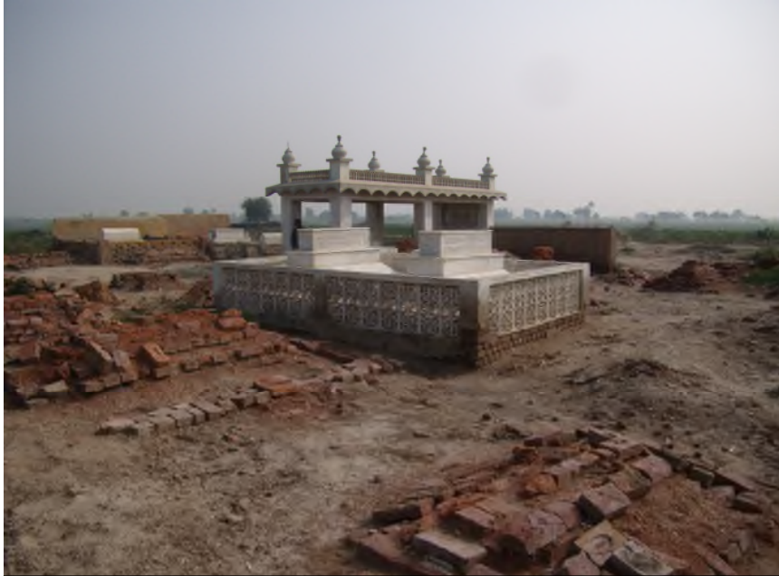
Graveyard of Talpurs Ameers next to the Mosque above is looked after by Talpurs of Tando Jam.

cavalry now as then with the addition of a perennial Barrage canal, running from North to South to the East of the village: this roughly follows the line of one of the scarped channels surmounted by Jacob in his abortive attack.