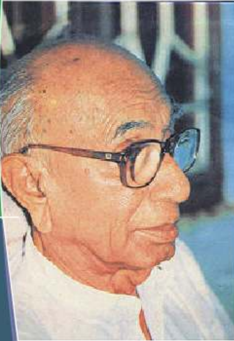
جي ايم سيد