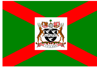
From: 1870 - 1955