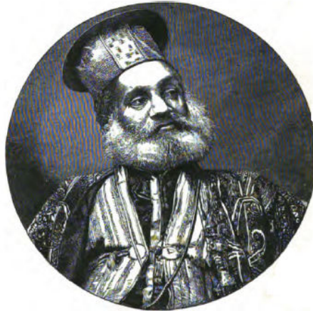
H. H. Meer Ali Moorad