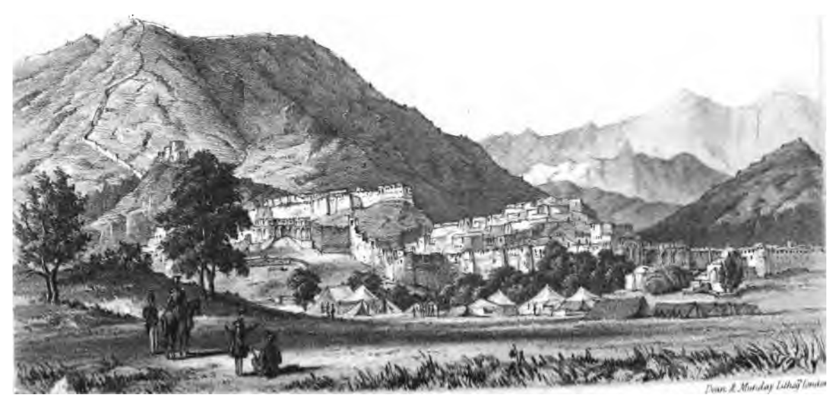
CITADEL OF BALA HASIR & TOWN OF KABUL

royal arch. This was wrought in a well-relieved fretwork of the most chaste and florid arabesque, surrounded by borders of running patterned arabesques, that had no Arabic inscription, and consequently may be Hindoo.