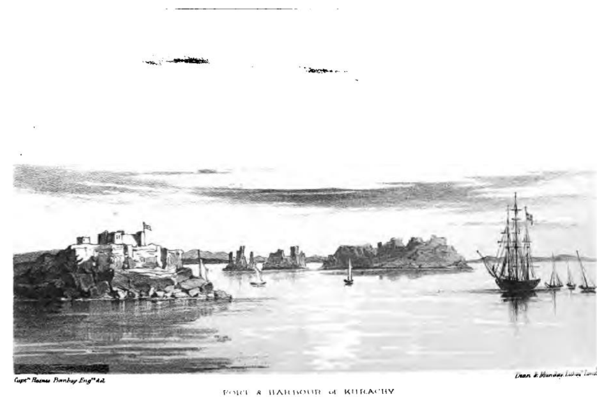
London Published by h Bentley, New, Burling ton Street, 184O

The creek approaches within six miles of Karachi in a westerly direction, and then turns south into the sea, within nine miles of Karachi harbour; and such is the description by Arrian of the western outlet.