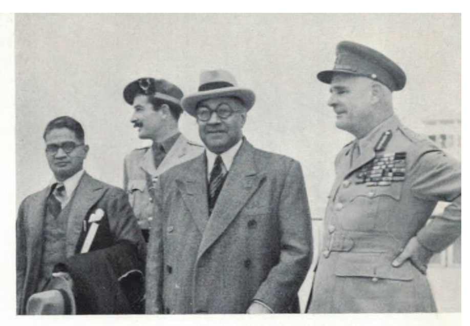
Departure for London: Lord Wavell and Liaqat Ali Khan at the Palam airfield