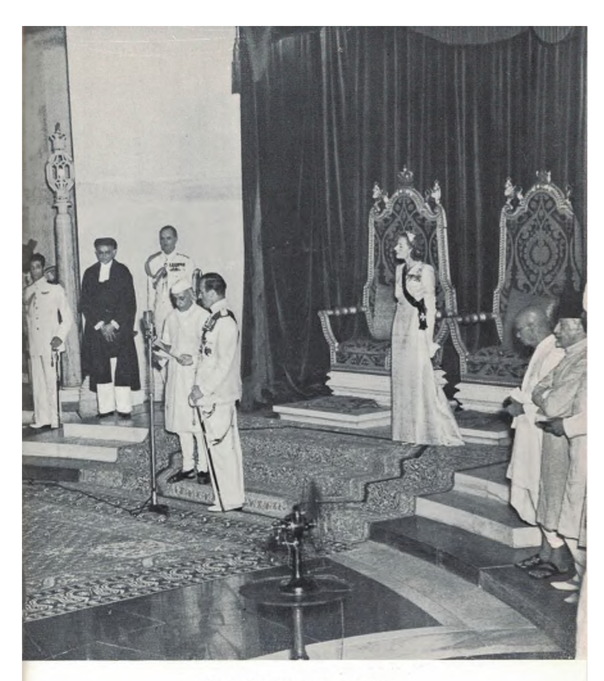
India's first prime minister Lord Mountbatten swearing in Nehru on 15 August 1947