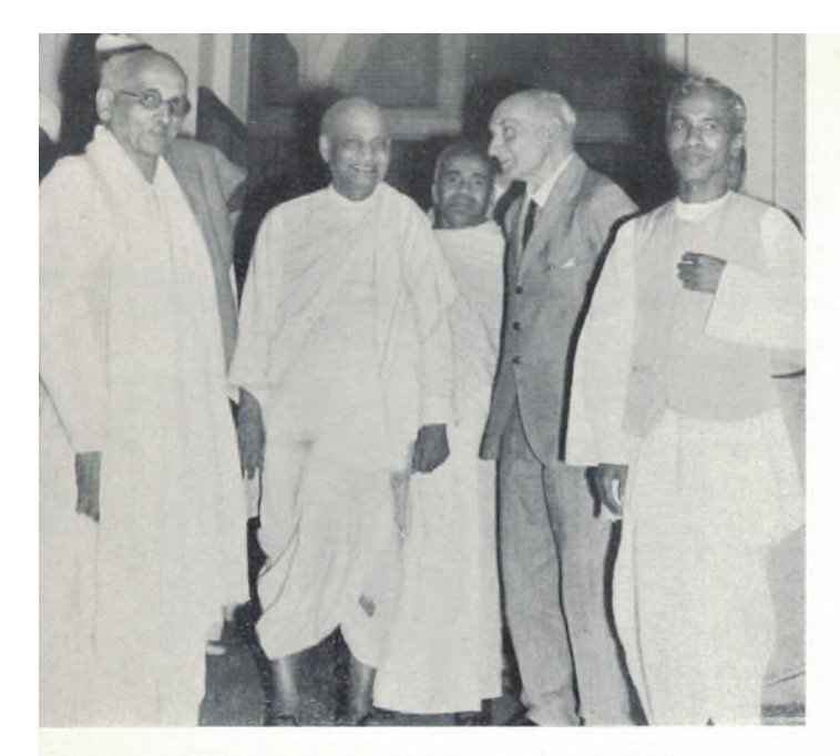
4. THE CABINET MISSION