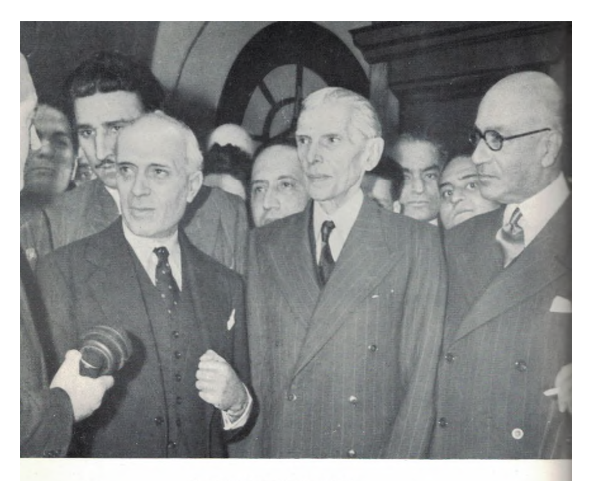
8. CONSULTATIONS IN LONDON Nehru and Jinnah with Sir Samuel Runganadhan, Indian High Commissioner in London