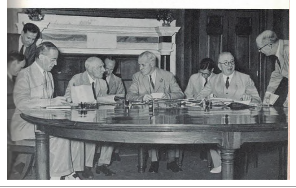
The Transfer of Power in India