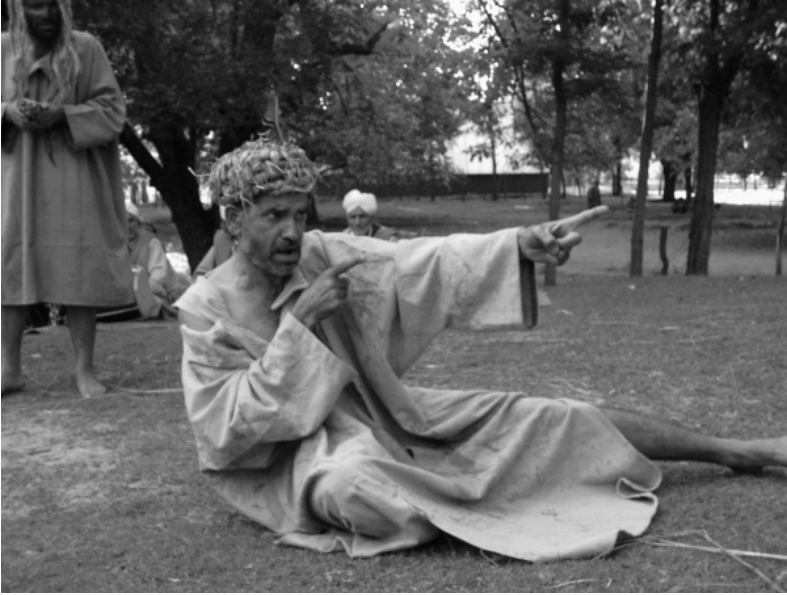
Figure 6.3 Mad Badshah on the heath.

Badshah sits down beside him, drops his head on his son’s chest, and whispers, “Rafiq!”