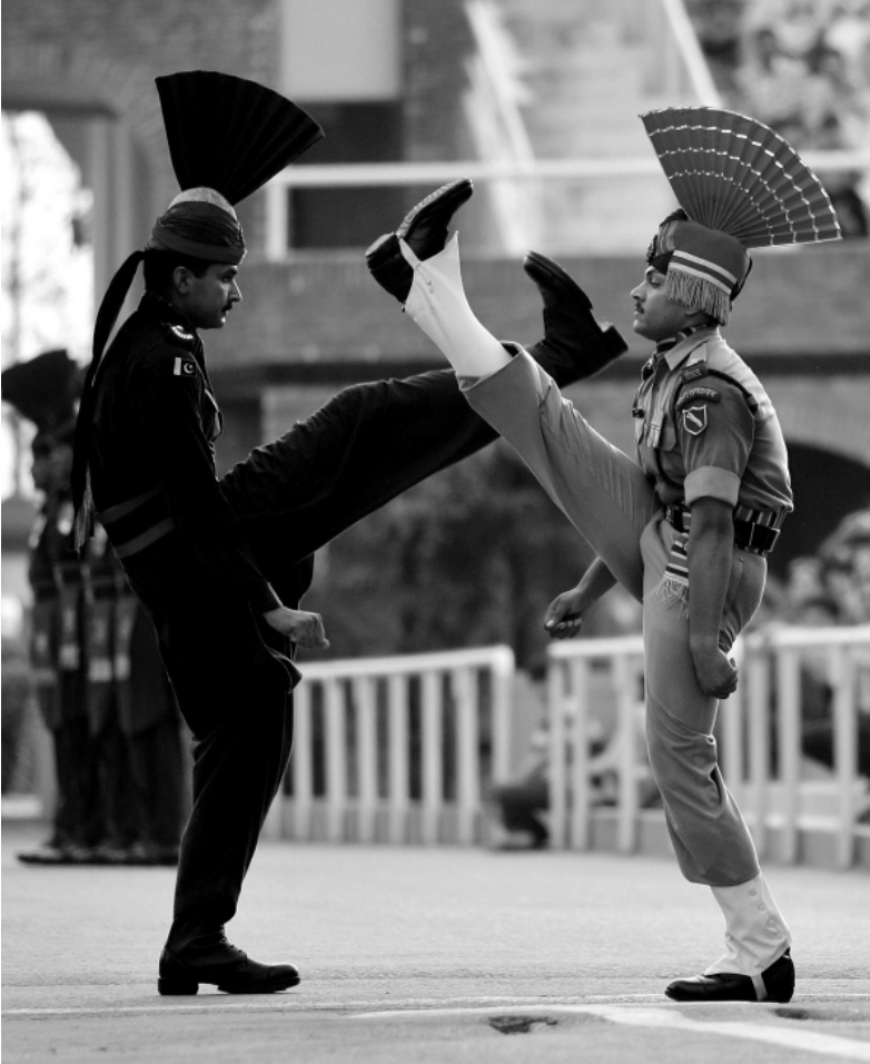
Figure 2.1 A Pakistan Ranger and an Indian Border Security Force soldier marching during the Wagah border ceremony.

shook hands and then proceeded to lower their respective flags that were placed high on poles planted at the foot of the gates. Buglers on either side played in perfect unison as both flags are lowered simultaneously and were then folded and carried away to their own stations. The commandants of both sides finally saluted each other, very briefly shook hands, and shut the respective gates with a ferocious crash.