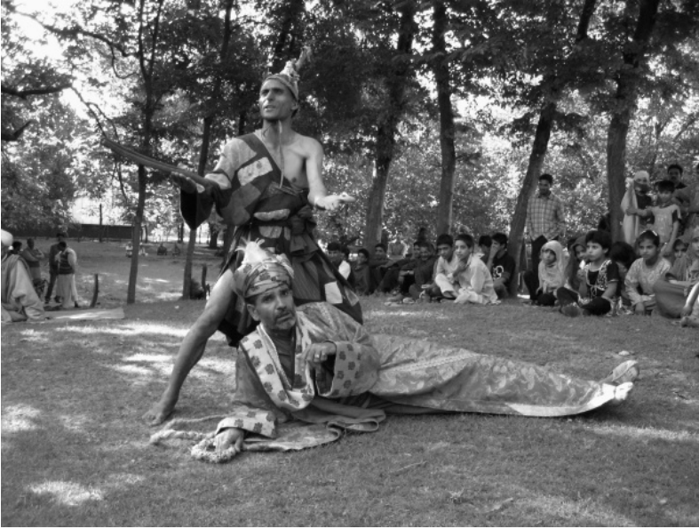
Figure 6.2 Interchangeable roles of Mashkara and Badshah, the jester and the king. Badshah Pather by M.K. Raina.

increasingly ecstatic states in the listeners. The devotional Sufiana Kalam is a spare and less structured mystical genre of poetry typically sung by a solo musician to minimal instrumentation. Qawwali and Sufiana Kalam are both performed at shrines of Sufi saints and at public concerts. Unlike Qawwali, Sufiana Kalam is sung in a monologue and requires less rigid training. Deriving from folk oral melodies, the Sufiana Kalam performers sing in vernacular languages (Gujrati, Punjabi, Kashmiri, Sindhi) to simple stringed instruments such as the tambur or ektara . Sufiana Kalam aspires toward a spiritual experience not only through the semantic content of texts but also by generating rhythmic cadences within the body.