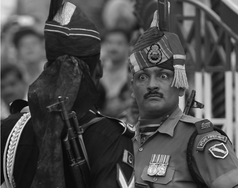
Figure 2.2 Soldiers glare at each other at the Wagah border.

The Wagah ceremony displays the magnificent power of the state at the same time that it dramatizes the antagonism between India and Pakistan. According to anthropologist Richard Murphy, the identical gestures of the soldiers across the border acquire a mirror effect through a logic of binary opposition. Drawing on theories of Lacanian psychoanalysis, he observes, “The mirror stage at Wagah is a dramatic illustration that Pakistan is defined as that which India is not. . . . On close examination this definition collapses into a dance of similitude: while the border ritual enacts difference, it also illustrates the fundamental similarities that Pakistani nationalist discourse seeks to deny.” 68 Murphy suggests that the rhetoric of difference melts into a “dance of similitude” and confounds Pakistan’s two-nation theory that held Hindus and Muslims as incommensurable ethnic groups.