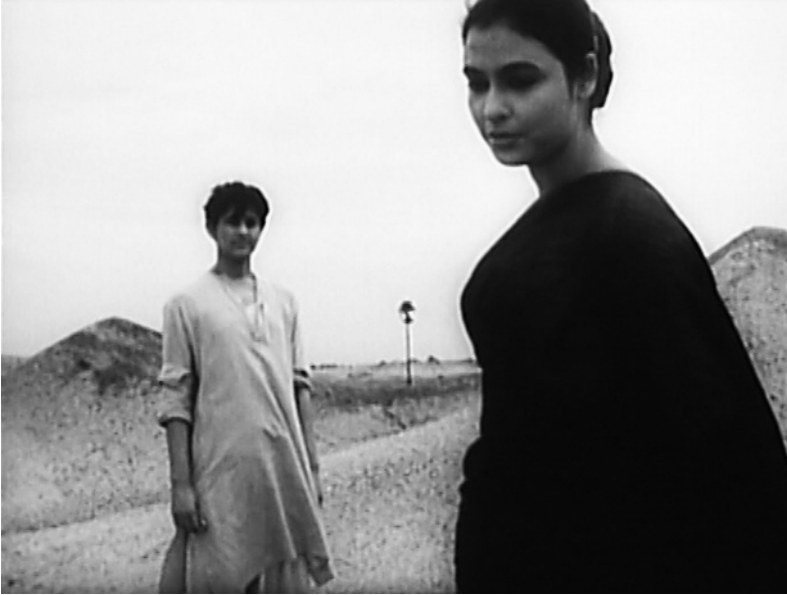
Figure 3.2 Mimetic doubles: Bhrigu and Anasuya reflect the relationship between person and place. Komal Gandhar by Ritwik Ghatak.