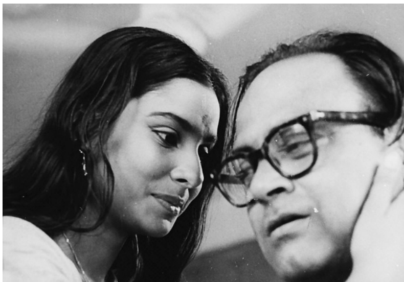
Figure 3.3 Kinship in crisis. Subarnarekha by Ritwik Ghatak.

Ghatak carefully etches out the powerful bond between Iswar and Seeta early in his film. In an intensely intimate scene between the two siblings, Iswar tells Seeta that she reminds him of their mother: “Your style of scolding reminds me of her,” he says, “the same stiff neck, same frown, same walk even. Sometimes, I get startled. I feel like I am being scolded by my mother.” Seeta strokes Iswar’s hair, “I am your mother.” Iswar raises her chin, her slender head poised upon his fingers, “You won’t leave me like our mother did?” he asks. Seeta remains silent. This scene, at once erotic, incestuous, and intimate, offers a moment to witness the ways in which the self is composed like a palimpsest, full of traces left by others. Her decision to marry Abhiram against the wishes of her brother, then, literally pulls the ground from under his feet. Her departure from his life leaves Iswar forlorn, disoriented, and orphaned. He stumbles through a preposterous world, one that leads him, at the end of the film, to seek out the sexual services of his sister.