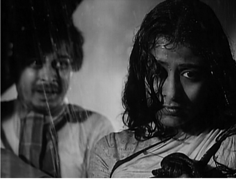
Figure 3.1 Neeta prepares to leave home. Meghe Dhaka Tara by Ritwik Ghatak.

life. A photograph captures the image of Shankar and Neeta, twin figures holding hands, standing against the immense hills. The clouds gather in the darkening storm outside, and the photograph crashes to the floor as the raga swells. The song heightens their bond with each other and estranges them from the rest of the family. The image of the twins, captured in the photograph, reinforces the nonsensuous similitude between person and place, and emphasizes the mimetic relationality between the twins.