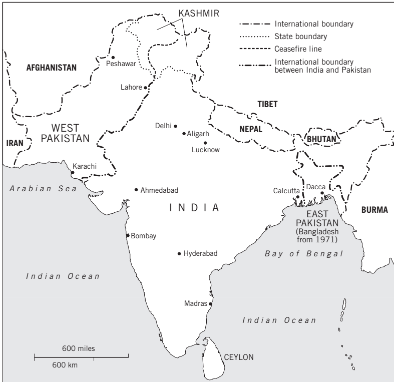
2 India and Pakistan after Partition