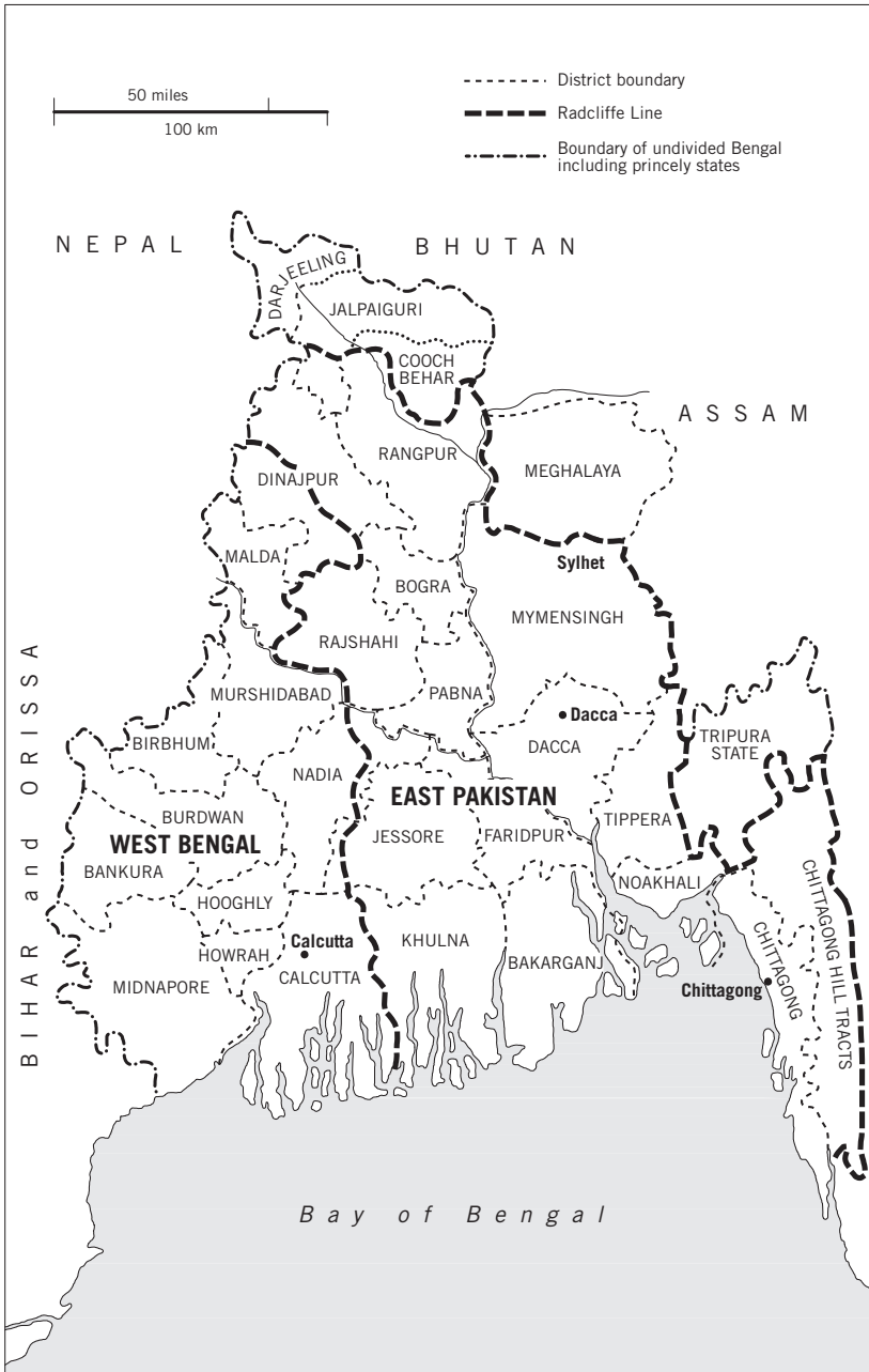
4 The Radcliffe Line in Bengal