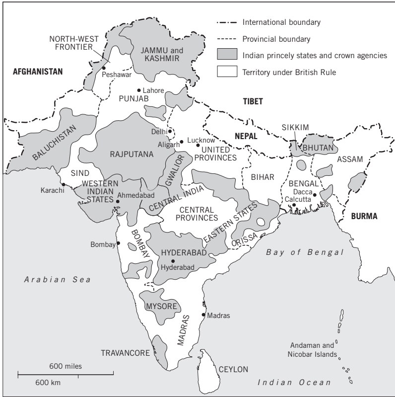
1 India before Partition