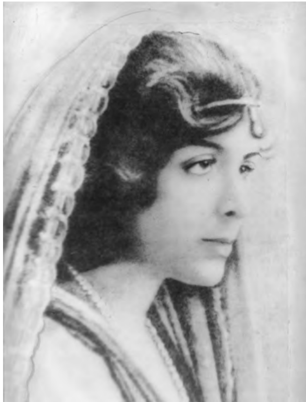
Jinnah's Wife (Mrs. Ruttanbai Jinnah)