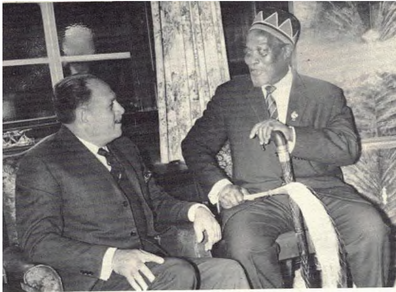
14a With Mr. Jomo Kenyatta, Prime Minister of Kenya, in London, 6 July 1964

Pakistan was designed to provide merely a deterrent force. There was no question, therefore, of Pakistan posing any kind of threat to India.