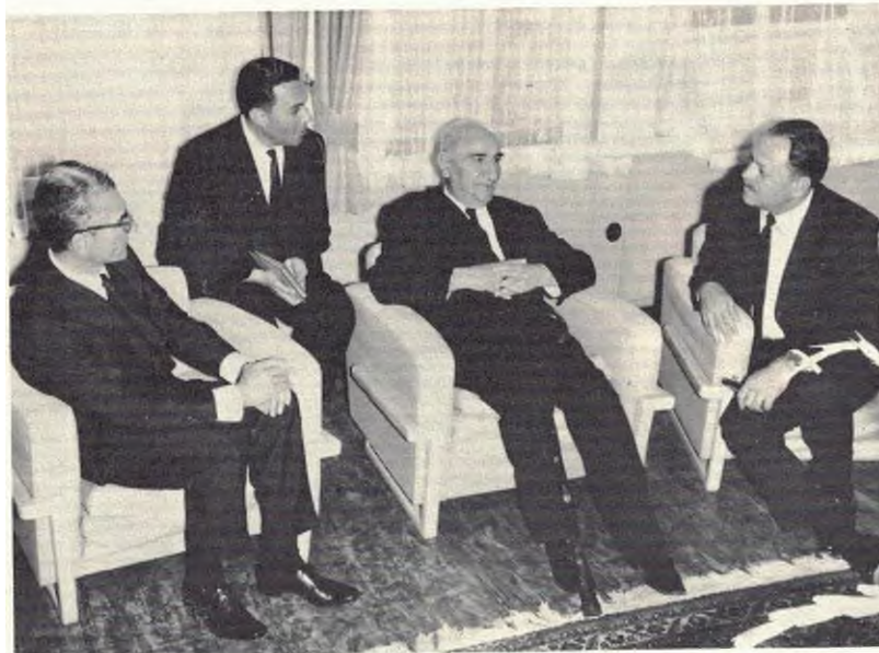
14b With President Jamal Cursel of Turkey (centre) and His Imperial Majesty the Shahinshah of Iran (left) at the summit meeting in Istanbul, 21 July 1964

I have spoken of India's hostility to Pakistan's alliance with the United States. She had resorted earlier to direct pressure to try to prevent Pakistan from joining it. In August 1953, after bilateral negotiations lasting some months, Nehru and Mohammad Ali