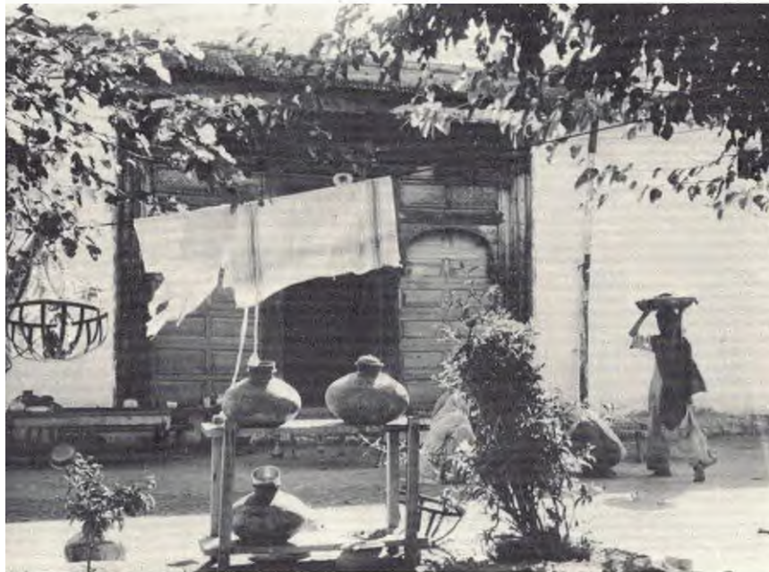
5 The author's family house in Rehana

I remember this very well as on that day I happened to be in Karachi, where I had gone to see the Prime Minister. I was aware of a great deal of coming and going and I found it very difficult to discuss any problem with the Prime Minister. Not that it was ever easy to discuss anything with him. In the midst of something quite serious he would