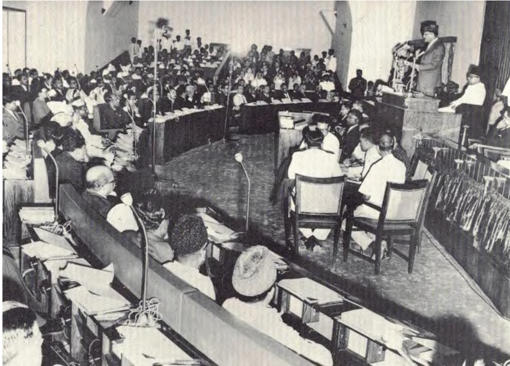
21 Addressing the National Assembly in Rawalpindi, 12 June 1965

groups subscribed wholeheartedly to Islam and both believed in building Pakistan into a strong and dynamic nation. But the two had not been able to work out a common and positive approach to national problems. Instead, the educated regarded the ulema as relics of the past and the ulema treated the educated as heretics and unworthy.