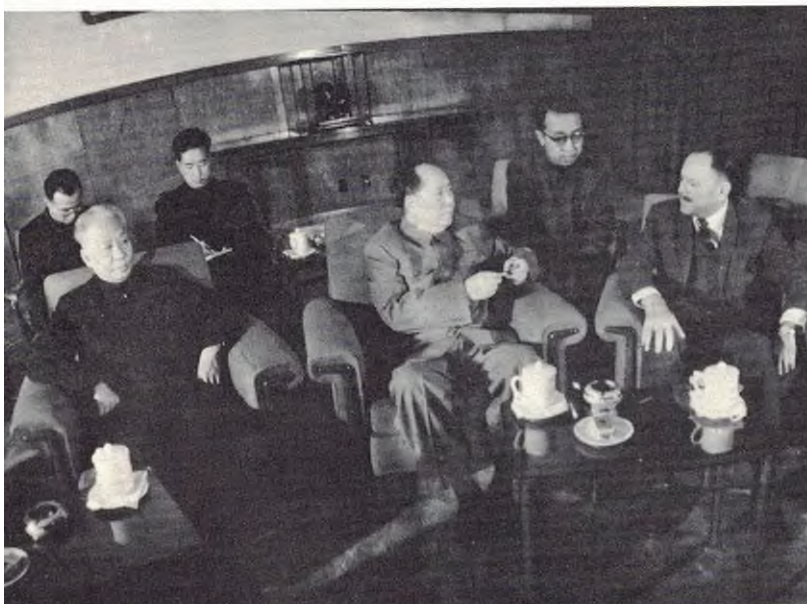
15b With Chairman Liu Shao-chi and Chairman Mao Tse-tung at the N.P.C. Hall, Peking, 4 March 1965