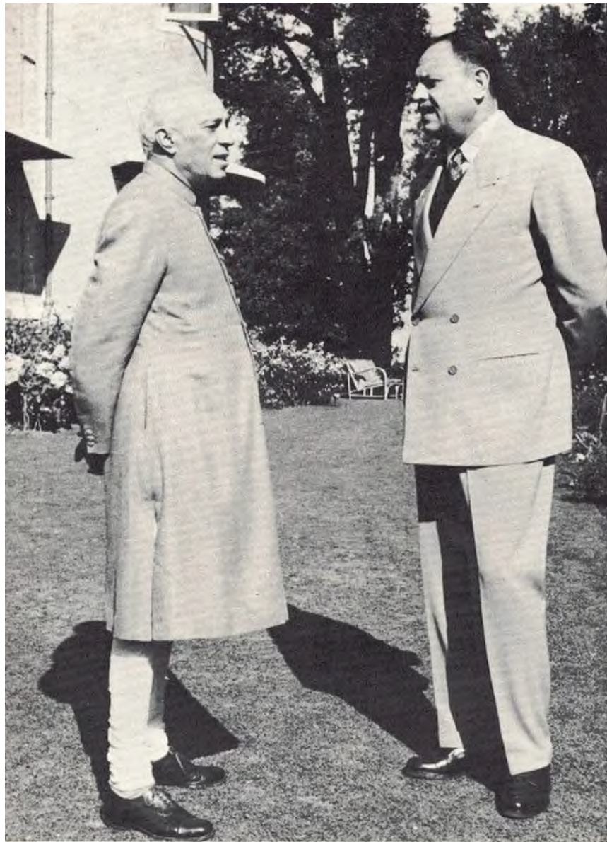
11 With the Indian Prime Minister Jawaharlal Nehru at Murree, 26 September 1960

recommendations could be implemented right away and a modest beginning was made within months of the acceptance of the Report by the government.