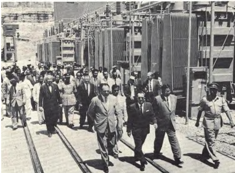
19b Going round the Karnaphuli Multipurpose Project, 31 March 1962

I think the limits within which Pakistan's relations with China can develop are fully understood and respected on both sides. There are two factors that can influence the