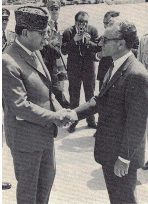
16a With His Imperial Majesty the Shahinshah of Iran at Mehrabad Airport, 1 July 1964

People in the United States sometimes ask; is not the military assistance given to India by the U.S.A. meant exclusively for fighting Communist China? Has not India pledged that she will not use these arms against Pakistan? Have not the United States and Great Britain also given assurances that if India employed these weapons in an aggression against Pakistan, they would act to thwart the aggression? Are not these assurances, they ask, sufficient to protect Pakistan against the possible misuse of western arms against her?