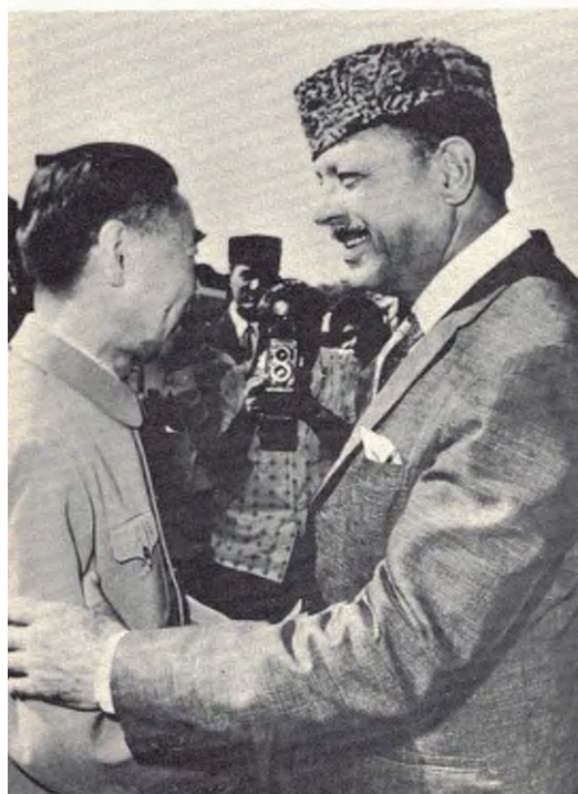
16b Welcoming Mr. Chou En-lai, Premier of the State Council of the People's Republic of China, on his arrival at Chaklala Airport, Rawalpindi, 2 June 1965