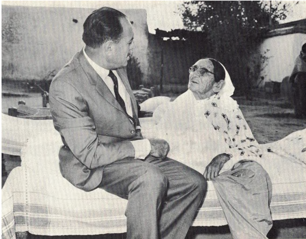
8 With his mother at Rehana, 1963

run the army but also keep a watch on so many other things concerning the security of the country. This would not be necessary' if we had men of character and principles manning the government.