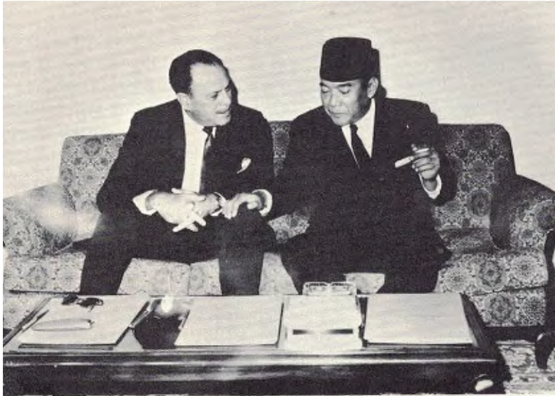
15a With the Indonesian President, Dr. Soekarno, at the President's Guest House, Rawalpindi, 19 September 1964

Baghdad Pact, Pakistan had become a member of 'an aggressive western alliance', and it responded by radically altering its stand on Kashmir. Thenceforth, the Soviet Union began to subscribe to India's claim that no plebiscite was possible or necessary in Kashmir and that Kashmir was an integral part of India.