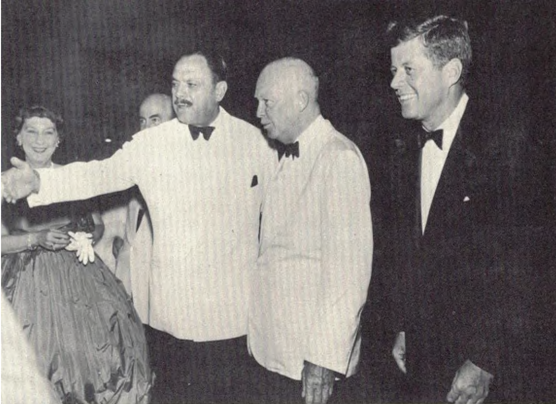
12 With Mr. and Mrs. Eisenhower and President Kennedy at a state dinner given by President Ayub at the Mayflower Hotel, Washington, 13 July 1961

secondary school programme had been on the preparation of the students for joining the universities. To correct this weakness the Commission recommended that secondary education should become a distinct stage with its own purpose, rather than act only as a preparation for higher education.