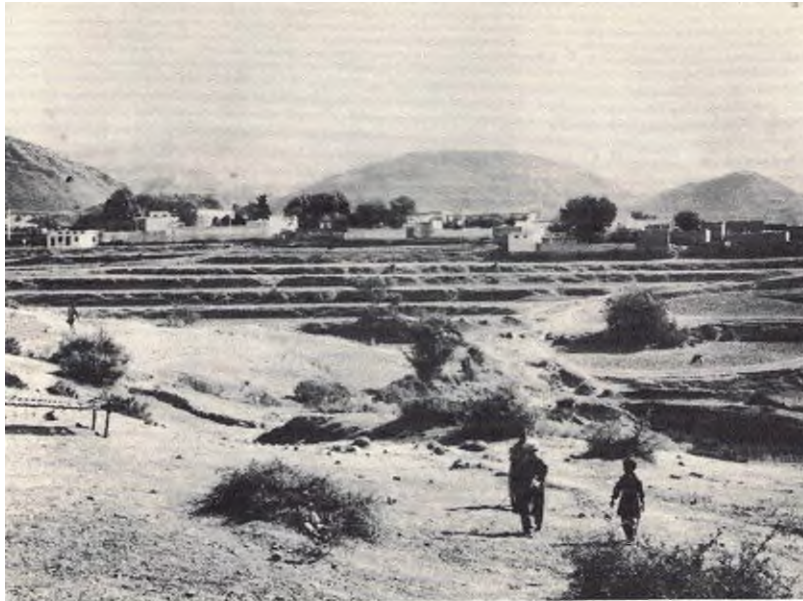
4a A distant view of the village of Rehana

There was only one sensible thing to do and that was to withdraw our troops from the North-West Frontier, and this in fact is what happened. A committee under that very fine officer, Lieut.-General Sir Francis Taker, had studied the problem and recommended that the army be withdrawn from Waziristan. This bold and sensible proposal was made before Pakistan came into being and the new government of Pakistan accepted the findings and decided to implement them.