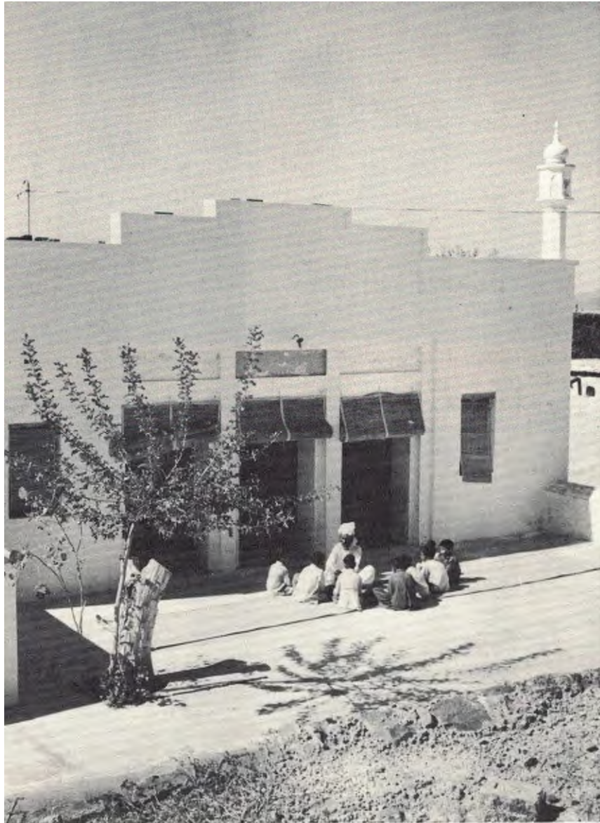
6 The Mosque at Rehana where the author studied the Holy Qur'an

pick up one's pen or something and ask, 'Where did you get this one?' He was like a child in these things. But apart from his usual childishness there was an atmosphere of peculiar hurry around the Prime Minister's house and I asked him what it was about. I had by then got to know these fellows: they were never in a hurry for any good purpose. He told me quietly that his colleagues wanted some amendment to be made in the Government of India Act by which the Governor-General's powers would be limited.