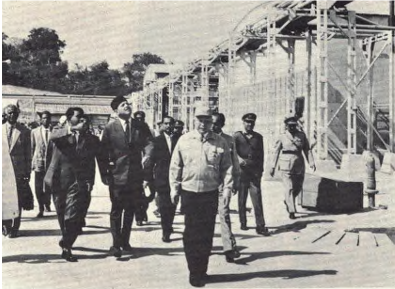
19a Visiting Fenchuganj fertilizer factory in Sylhet, 4 February 1962

some alien philosophy of life. This argument did not impress the Americans, perhaps because in their life religion does not play the same decisive role as it does in ours. The Americans think of communism more as a contagion than as the result of economic distress and social disintegration.