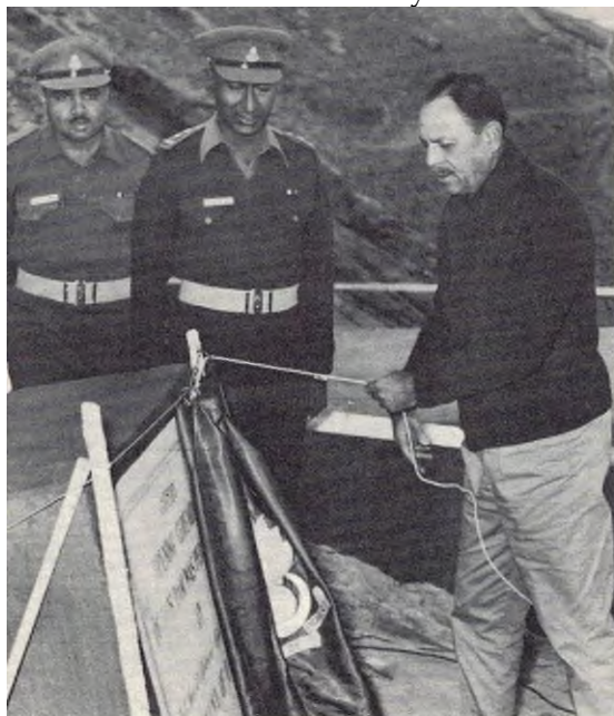
20a Opening the Srakha Gravity Dam, constructed by army engineers, near Quetta, 14 December 1962

I mentioned earlier that our membership of the Baghdad Pact introduced an element of strain in our relations with the U.S.S.R. The Indians were not averse to exploiting the situation and presented us to the Soviet Union as some kind of theocratic State opposed to all liberal movements. In Pakistan, too, there was a certain inhibition about the U.S.S.R. and a section of the people believed that contact with Russia would encourage the growth of communism in the country.