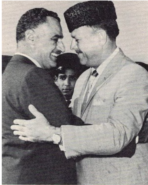
22a With President Gamal Nasser of the United Arab Republic, in Cairo, 5 November 1960

contrary to the teachings and message of Islam. Muslim society could not move forward unless Islam was relieved of all the inhibiting and alien influences which had distorted its real character.