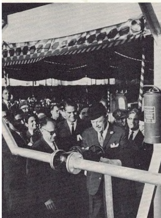
20b Inaugurating the installations of the National Oil Refinery, Karachi, 21 February 1963