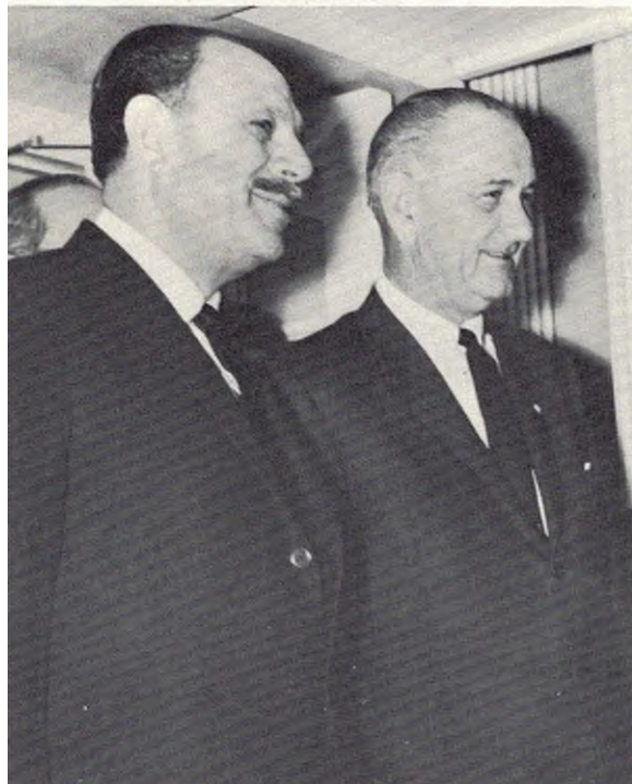
22b With President Johnson in Washington, 14 December 1965

It was this that was my great concern and I recorded the following note on 12 April 1959: