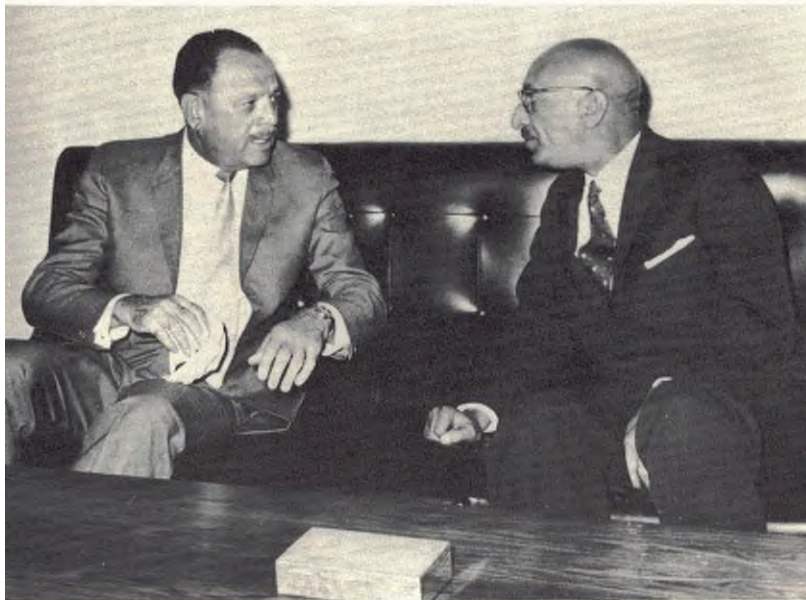
13b At formal talks with His Highness King Zahir Shah of Afghanistan in Kabul, 1 July 1964

This attitude also explains why India has, throughout, opposed the grant of military aid to Pakistan. Not that she feared Pakistan: after all, India is five times her size and Indian armed forces are four times the size of Pakistani forces. In actual fact the military aid to