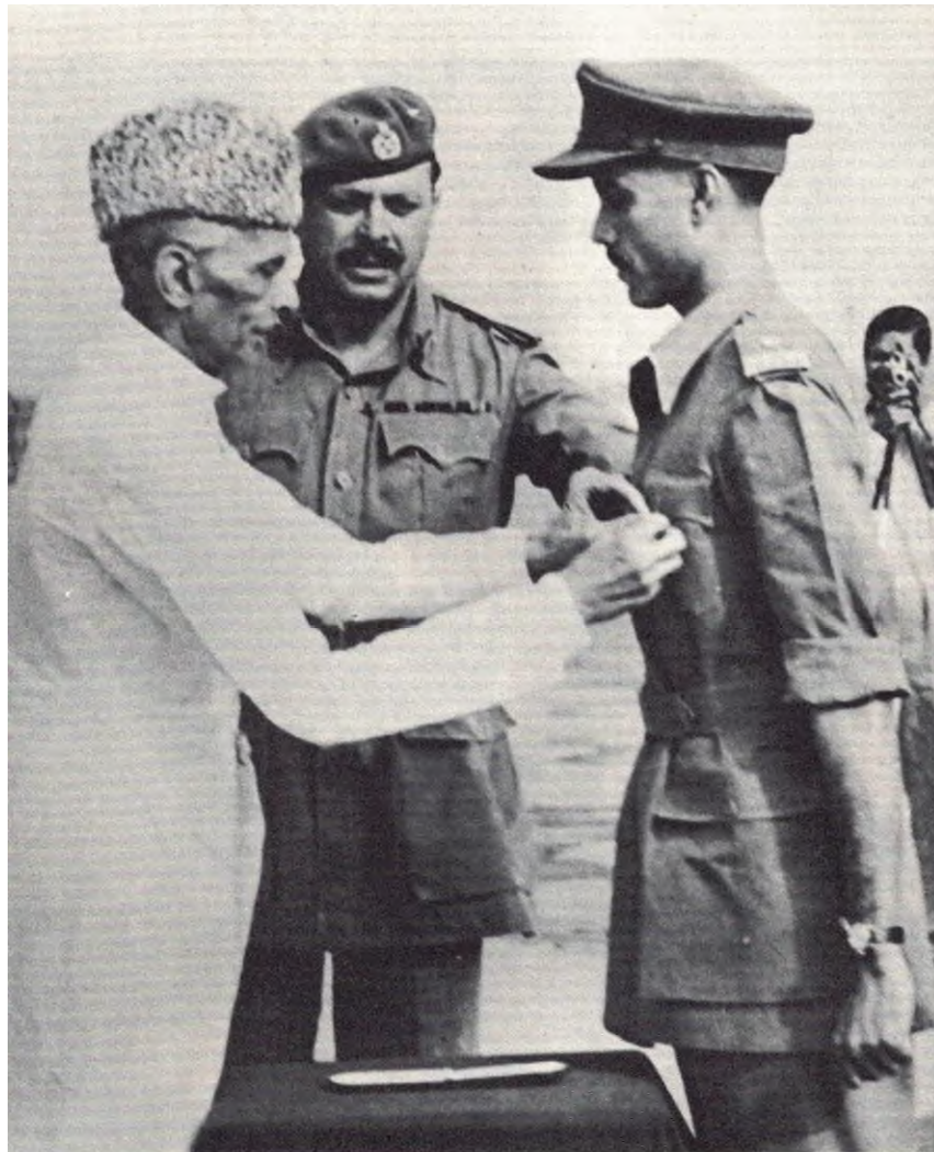
9 With Quaid-e-Azam Mohammad Ali Jinnah, as G.O.C. East Pakistan in Dacca, 20 March 1948

business must be re-established. There was a sense of fear in business circles and it was important to restore business confidence.