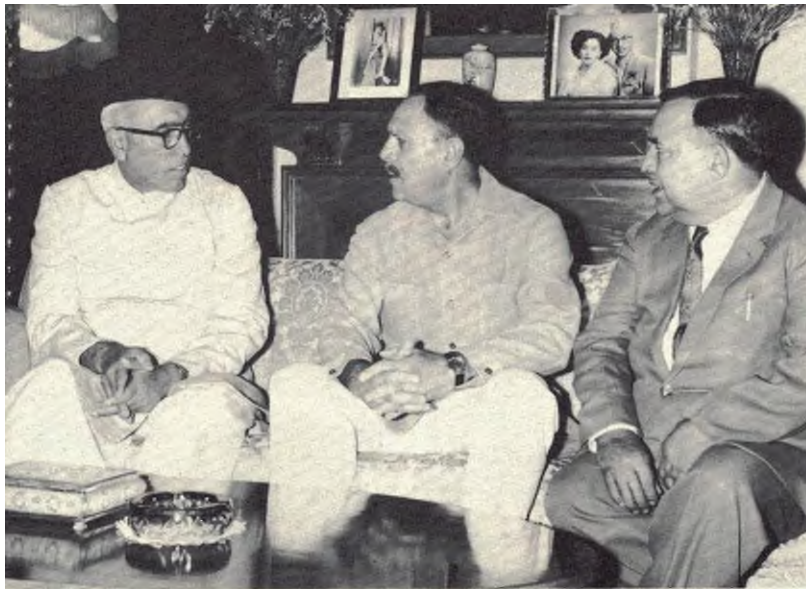
13a Sheikh Mohammad Abdullah, the 'Lion of Kashmir', at a meeting with the author in Rawalpindi soon after his arrival from New Delhi, 24 May 1964

Pakistan under this Agreement. There could not be a more illuminating commentary on India's historic altitude towards Pakistan.