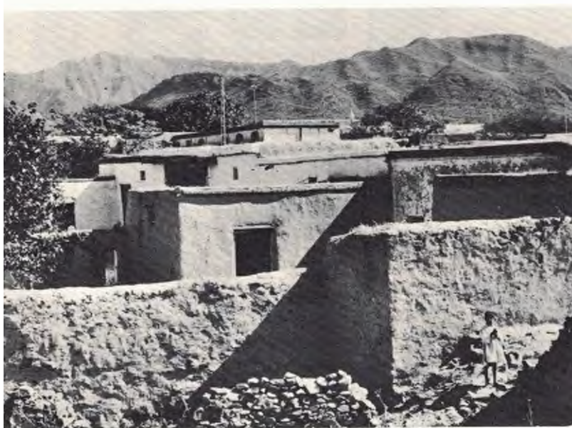
4b Rehana (in the background the top of the old family house can be seen)