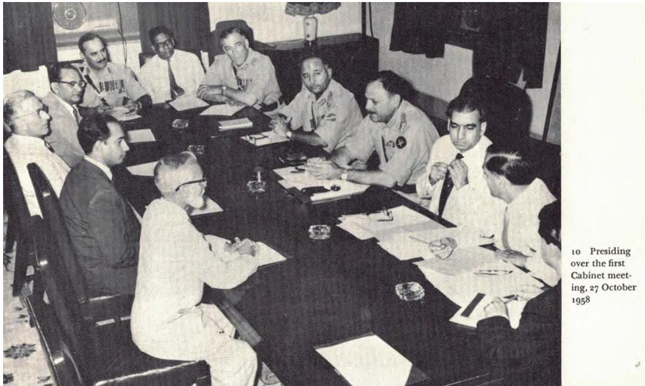
10 Presiding over the first Cabinet meeting, 27 October 1958

have adequate funds to run the paper, with the result that they were earning their livelihood by resorting to blackmail. It was important that we build a healthy and responsible Press.