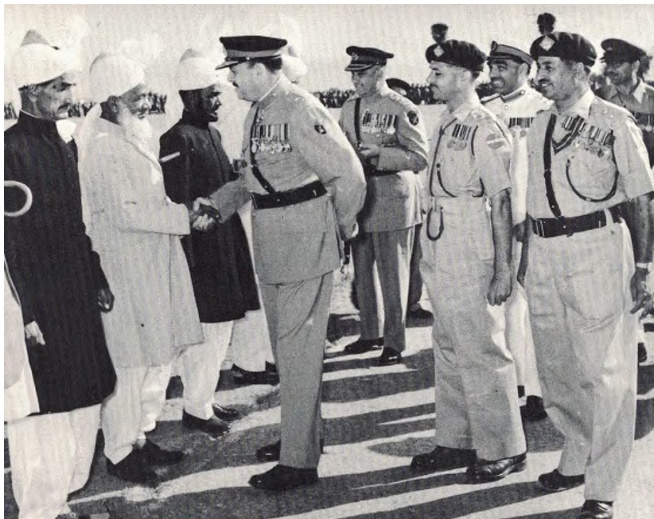
17 Meeting ex-service men on Dushak Day in Rawalpindi, 14 October 1961

demarcation of the border with us. The two sides nominated their teams of experts to examine the problem.