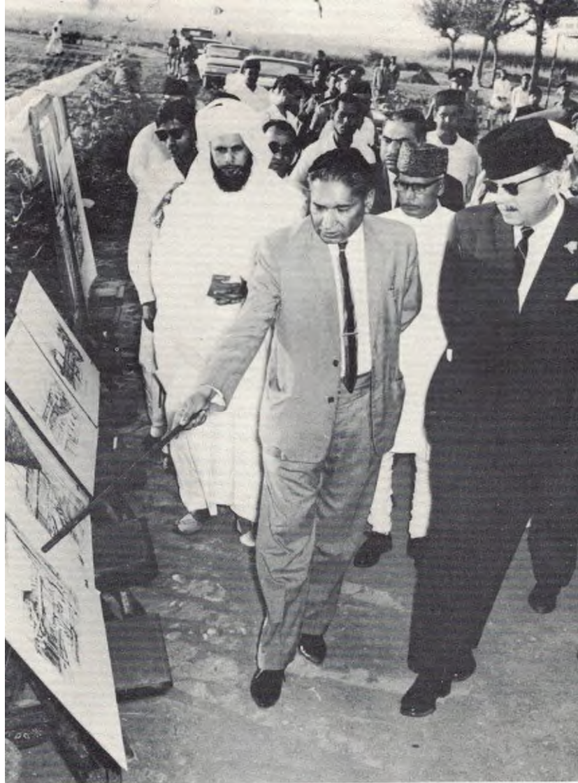
18 Seeing the building plans for Islamabad, 15 September 1963

So far as we were concerned, the whole thing was essentially dealt with as a commercial transaction. After the transaction had been concluded all kinds of political interpretations were put on it. It was said that Pakistan had opened a window for the Chinese to look into the rest of the world. Now that was obviously overdrawing the picture. Surely, if we had not entered into the arrangement, KLM or BOAC would have bagged the contract. And there was no lack of windows for the Chinese through which to catch a glimpse of the world. After this there was increased travel between China and Pakistan, though even before, the Chinese Prime Minister had visited Pakistan when Suhrawardy was Prime Minister, and Suhrawardy had also visited China.