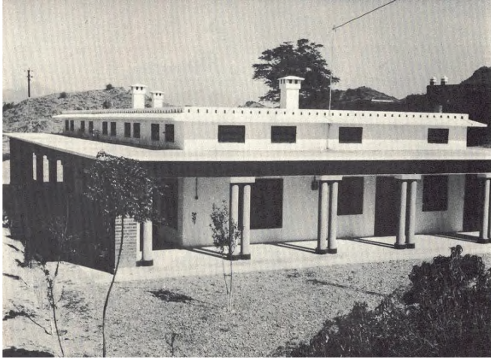
7 The author's present house at Rehana