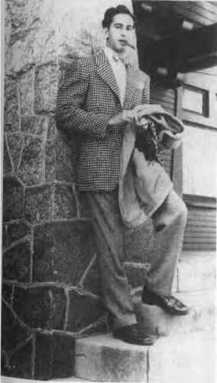
Left: Zulfikar Ali Bhutto in California, 1948.