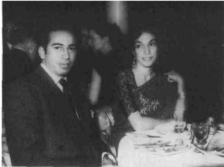
Top: Zulfikar Ali Bhutto in London with his bride, Begum Nusrat Bhutto, 1953.