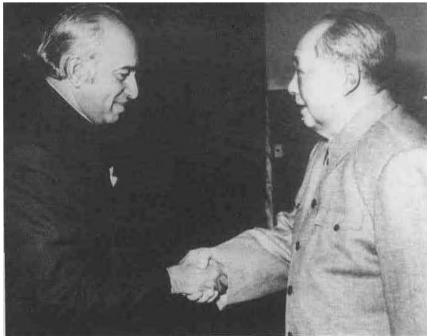
Chairman Bhutto and Chairman Mao, Sino-Pakistan summit. May 1974.