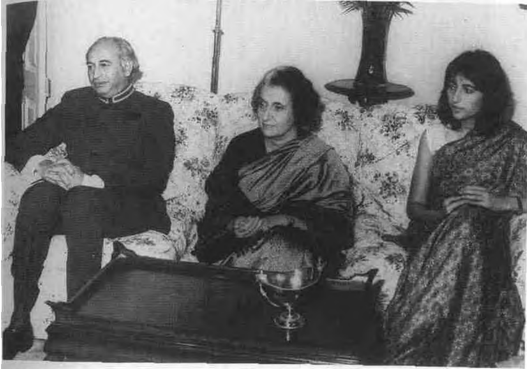
At Simla, President Z. A. Bhutto, Prime Minister Indira Gandhi, and Benazir Bhutto, summer of 1972.