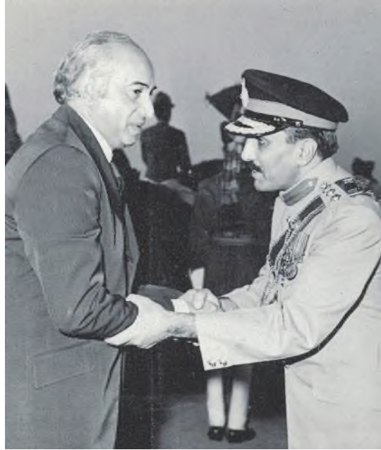
Zia as Colonel Commandant, greeting Bhutto, the Colonel in Chief of the Armored Corps, at Kharian in 1 November 1974