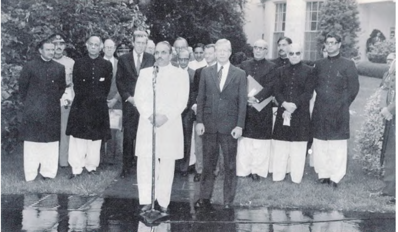
President Zialul Haq and Jimmy Carter with the Pakistani delegation on the lawns of the White House in October 1980