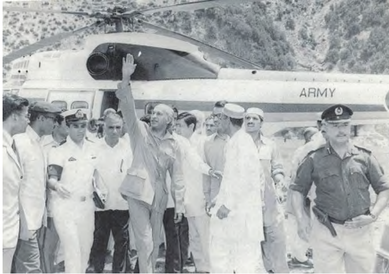
Prime Minister Zulfikar Ali Bhutto arrives by helicopter and waves to the cheering crowds at Dir on 10 July 1974