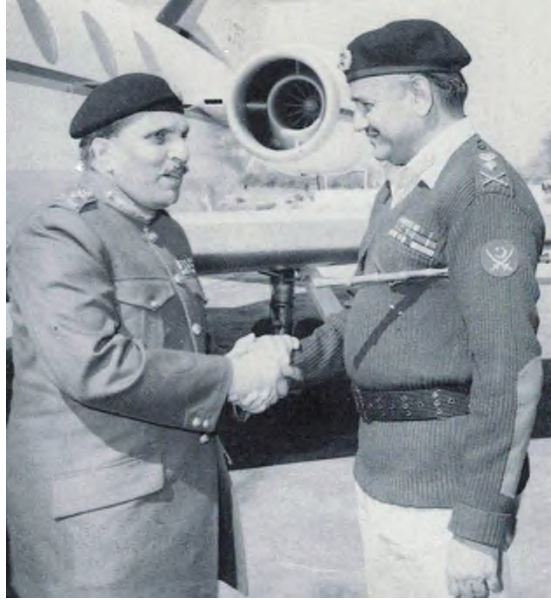
VCOAS Arif greeting President and COAS Zia During a visit to Corps Headquarters, Multan, on 25 February 1986.