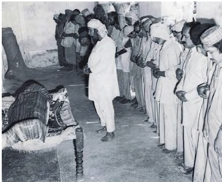
Funeral prayers being offered for Zulfikar Ali Bhutto in his ancestral village