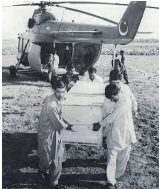
Zulfikar Ali Bhutto's coffin is unlocked from a helicopter for transfer to an ambulance at Garhi Khuda Baksh on 4 April 1979