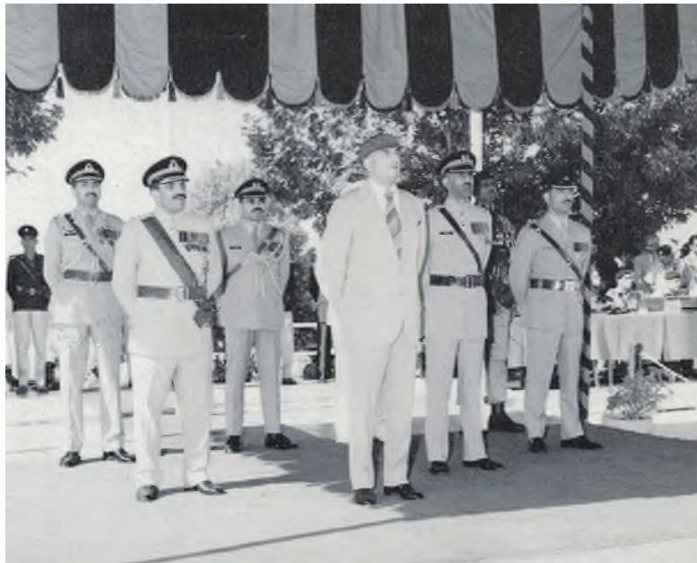
Bhutto reviewing the Passing Out Parade at the Pakistan Military Academy, Kakul, on 18 November 1976