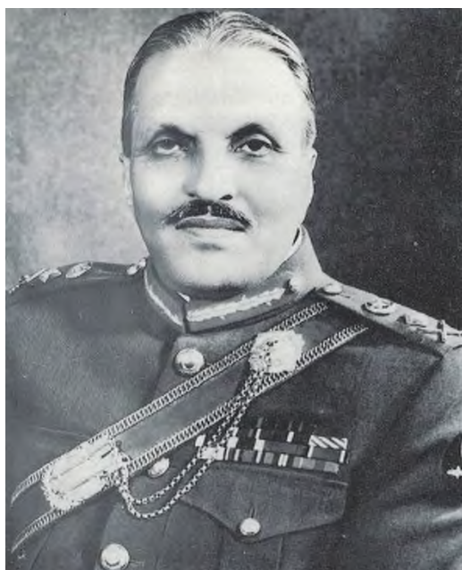
General Ziaul Haq