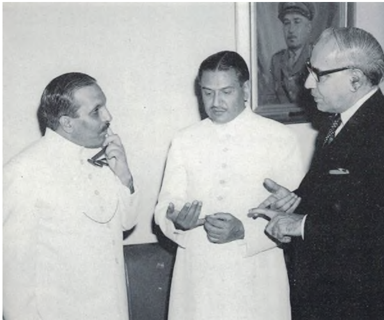
The author with President Zialul Haq and the Minister for Finance, Ghulam Ishaq Khan, at Presidency in Rawalpindi