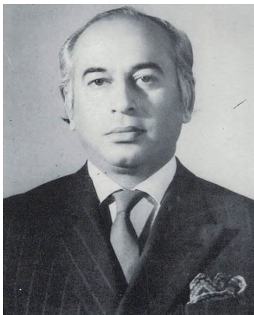
Zulfikar Ali Bhutto