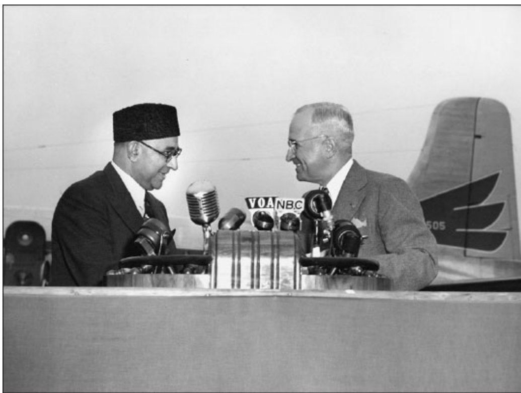
Pakistani prime minister Liaquat Ali Khan meets US president Harry S. Truman during a visit to the United States in May 1950. Prime Minister Khan was assassinated in 1951 at Company Bagh, later renamed Liaquat Bagh, the same location where Benazir Bhutto was killed in 2007.

The PPP demanded a United Nations investigation of the assassination. In early January 2008, widower and now PPP leader, Asif Ali Zardari, wrote in the Washington Post , "I call on the United Nations to commence a thorough investigation on the circumstances, facts and cover-up of my wife's murder, modeled on the investigation into the assassination of former Lebanese Prime Minister Rafiq-al-Hariri." 25 When Zardari became president of Pakistan on September 6, 2008, the call became not merely a popular notion but an official request from a United Nations member state to the secretary-general of the organization. Five months later, Ban Ki-moon's office called me in Chile and the investigation began.