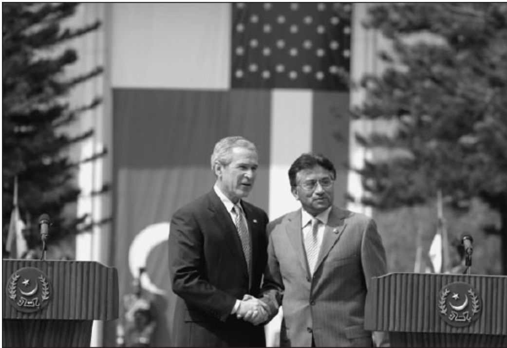
President George W. Bush and Pakistani president Pervez Musharraf shake hands after concluding a joint press conference in Islamabad, during a visit of the US president to Pakistan on March 4, 2006.

interrogation from the same individual. We never saw the “diplomatic liaison” again on any of our subsequent visits.