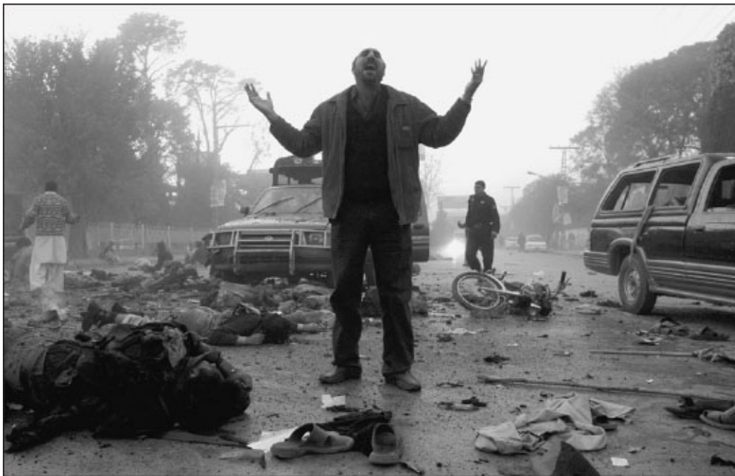
A survivor stands amid the carnage of dead and wounded immediately following the bomb and gunfire attack that killed Benazir Bhutto at Liaquat Bagh, Rawalpindi, on December 27, 2007, following an electoral rally.