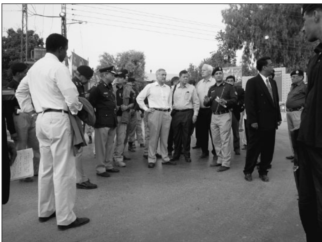
The commissioners and staff of the UN Commission of Inquiry at the exact site at Liaquat Bagh, Rawalpindi, where Benazir Bhutto was killed, inspecting the area and interviewing senior policemen about the facts and circumstances of the assassination.

By the time Musharraf took over, the post of prime minister had been suspended five times in Pakistan due to martial law or another form of military intervention, and no elected civilian prime minister had ever served a full five-year term. The military had been directly ruling the country for three of the six decades since independence.