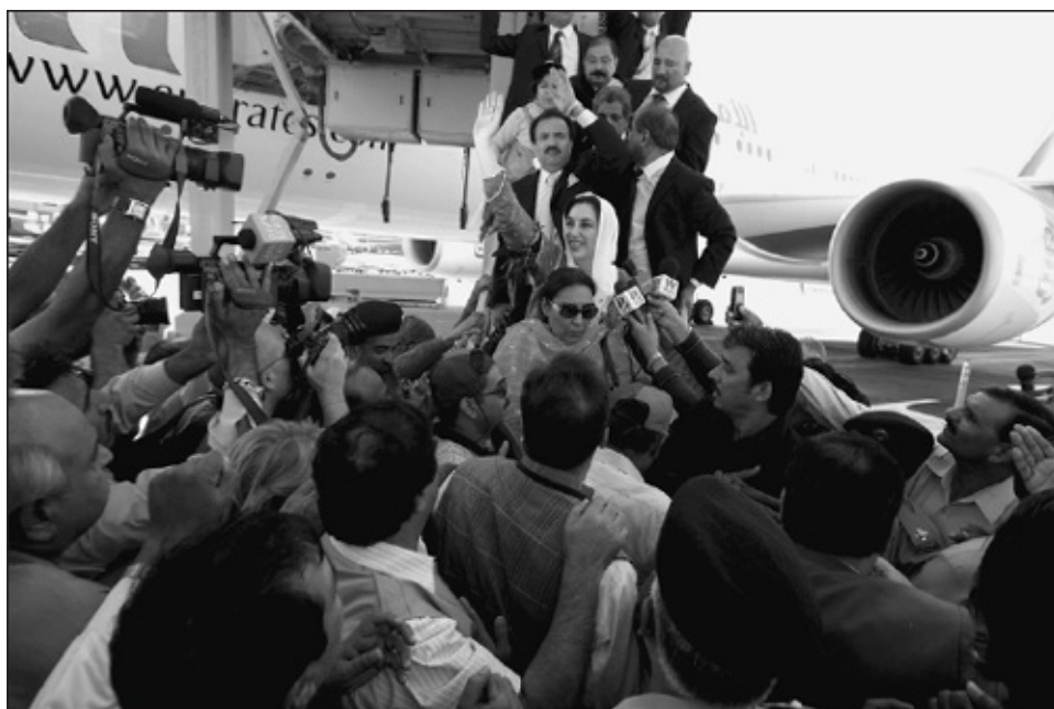
Benazir Bhutto descending from a plane at Karachi airport and waving to supporters upon arrival back in her homeland on October 18, 2007, following years of self-imposed exile, accompanied by advisers and leading members of her party. The US and UK governments were key facilitators of her return to Pakistan.

Washington believed that a political adjustment was needed. "Musharraf was on borrowed time in Pakistan," wrote the then US secretary of state Condoleezza Rice in her memoir. The answer, according to Rice, "lay in forging an alliance between the two strongest political forces in the country: Musharraf and former Prime Minister Benazir Bhutto." 45 Musharraf had to keep the military in line, but Benazir Bhutto had to be brought on board to provide democratic legitimacy to a broader coalition government and a more committed stand on terrorism with wider domestic political backing.