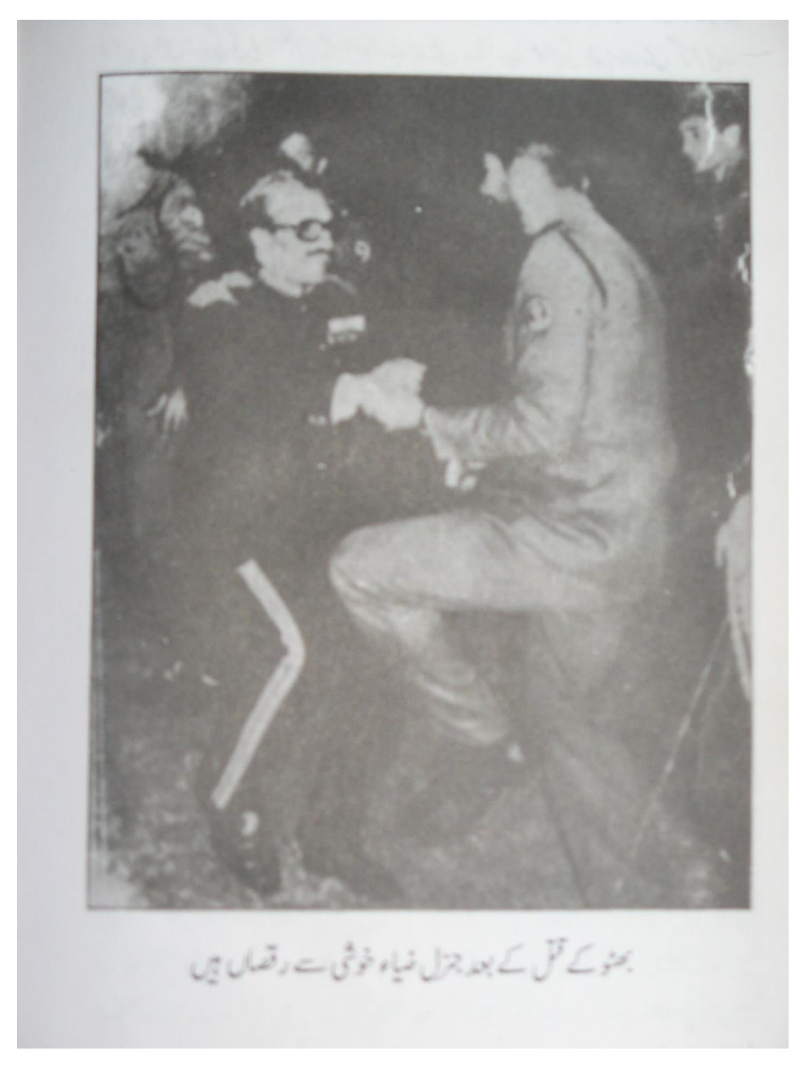
Figure 2 General Zia-ul-Haq, dancing in real after executing ZAB.

April, Maulana Mufti even said that PNA ministers should now resign as their objective had been achieved. ^{406}