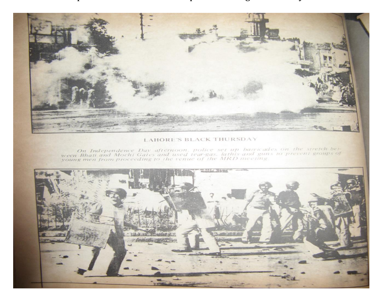
Figure 7 Provinicial Government's violent response to the MRD's peaceful protest on 14 August 1986 in Lahore.

action to stop its workers from engaging themselves with the government's supporters who were tearing down their posters. They were unable however to stop the violence that then exploded throughout the city.