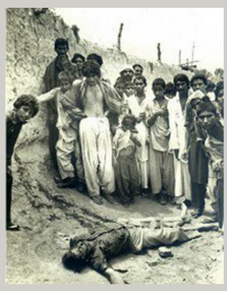
A dead protester in Moro