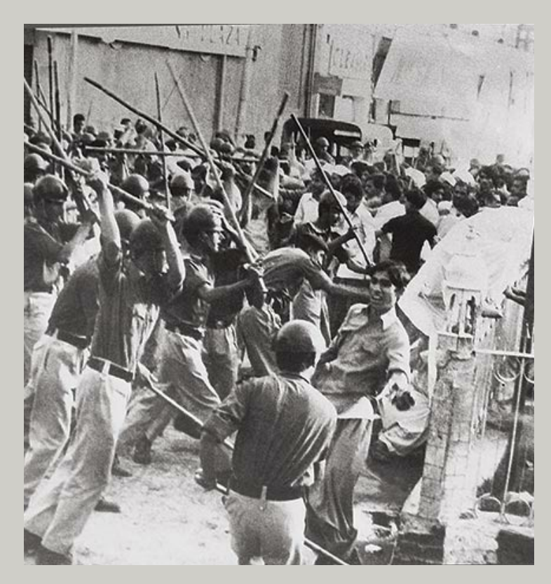
Police attacks a MRD rally in Karachi