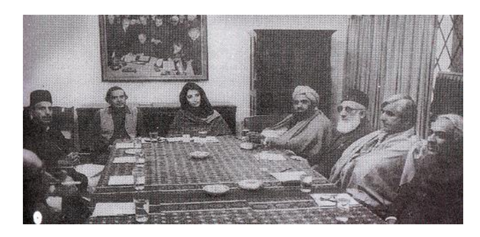
Figure 4 BB chairing the MRD in process meeting in 1980.

from both parties,<sup>525</sup> they finally agreed on one broad agenda 'Pakistan and martial law cannot exist.'<sup>526</sup> Finally on 6 February 1981, three major demands were put before the regime under the umbrella of the Movement for the Restoration of Democracy, which will be discussed in the next chapter.