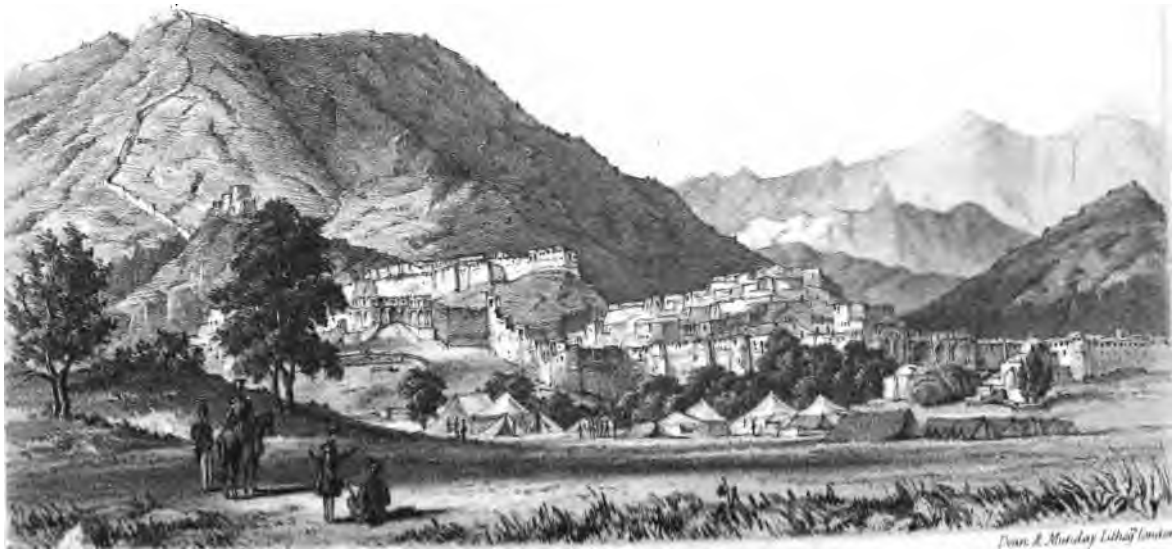
CITADEL OF BALA HASIR & TOWN OF KABUL

royal arch. This was wrought in a well-relieved fretwork of the most chaste and florid arabesque, surrounded by borders of running patterned arabesques, that had no Arabic inscription, and consequently may be Hindoo.