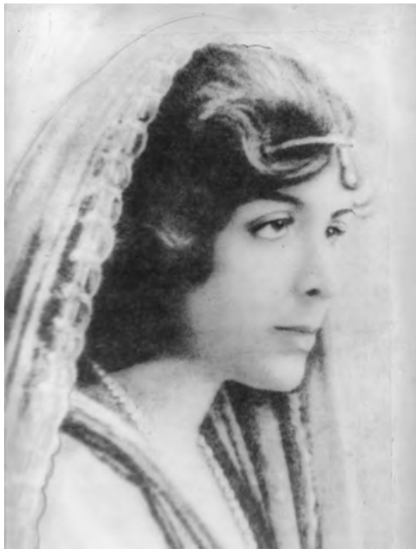
Jinnah's Wife (Mrs. Ruttanbai Jinnah)