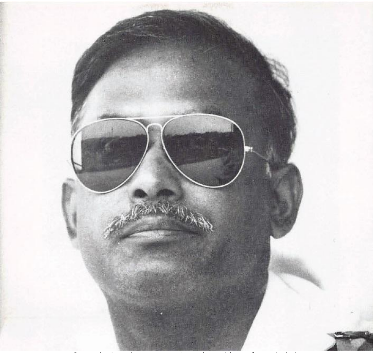
General Zia Rahman, assassinated President of Bangladesh